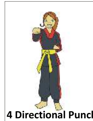
4 Directional Punch